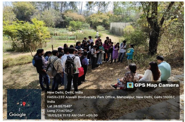
Pic 4. Ma'am explaining the students about the importance of the butterfly conservatory in the park