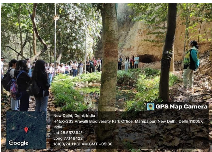
Pic 5. Ma'am interacting with the students in the orchid conservatory, Aravalli Biodiversity Park