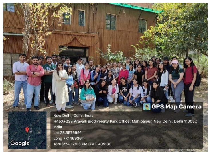
Pic 6. The group photo of all the attendees of the field trip taken in front of the park office at the end of the field trip