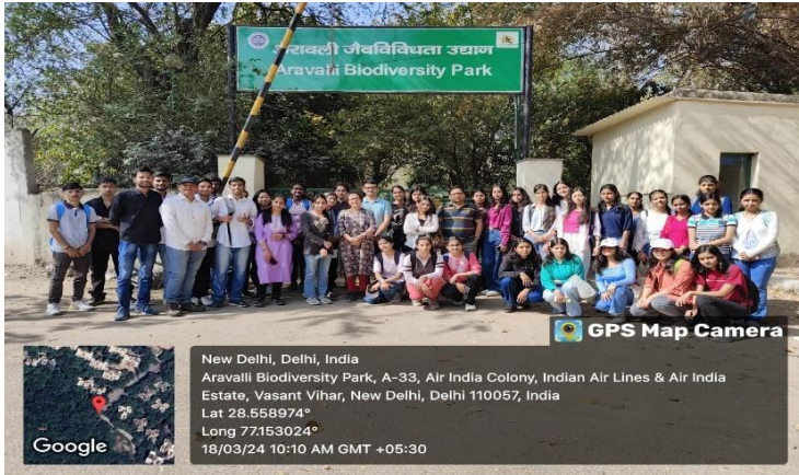
Pic 1. Group photo of the faculties and students of botany department at the beginning of the field trip in front of the park gate