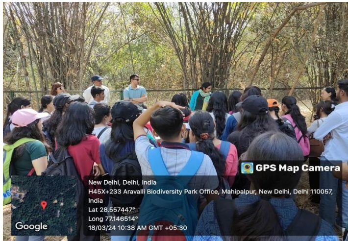
Pic 3. Madam briefing the students about the history and conservation status of the biodiversity park